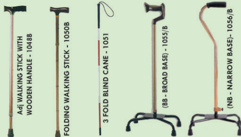
➤ WALKING AIDS