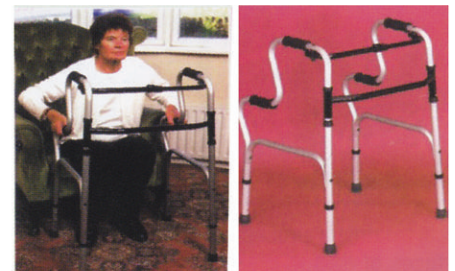
➤ RISING WALKER- 4092

PLEASE VISIT WWW.JITRON.COM FOR OUR OTHER PRODUCT & SERVICES