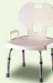
➤ COMMODOE SHOWER CHAIR - 2076/G

Height adjustable for maximum comfort. Seat and backrest made of blow moulded durable plastic with non-slip surface. Handle fit either left or right side of bench. A MUST for safer shower or bath.